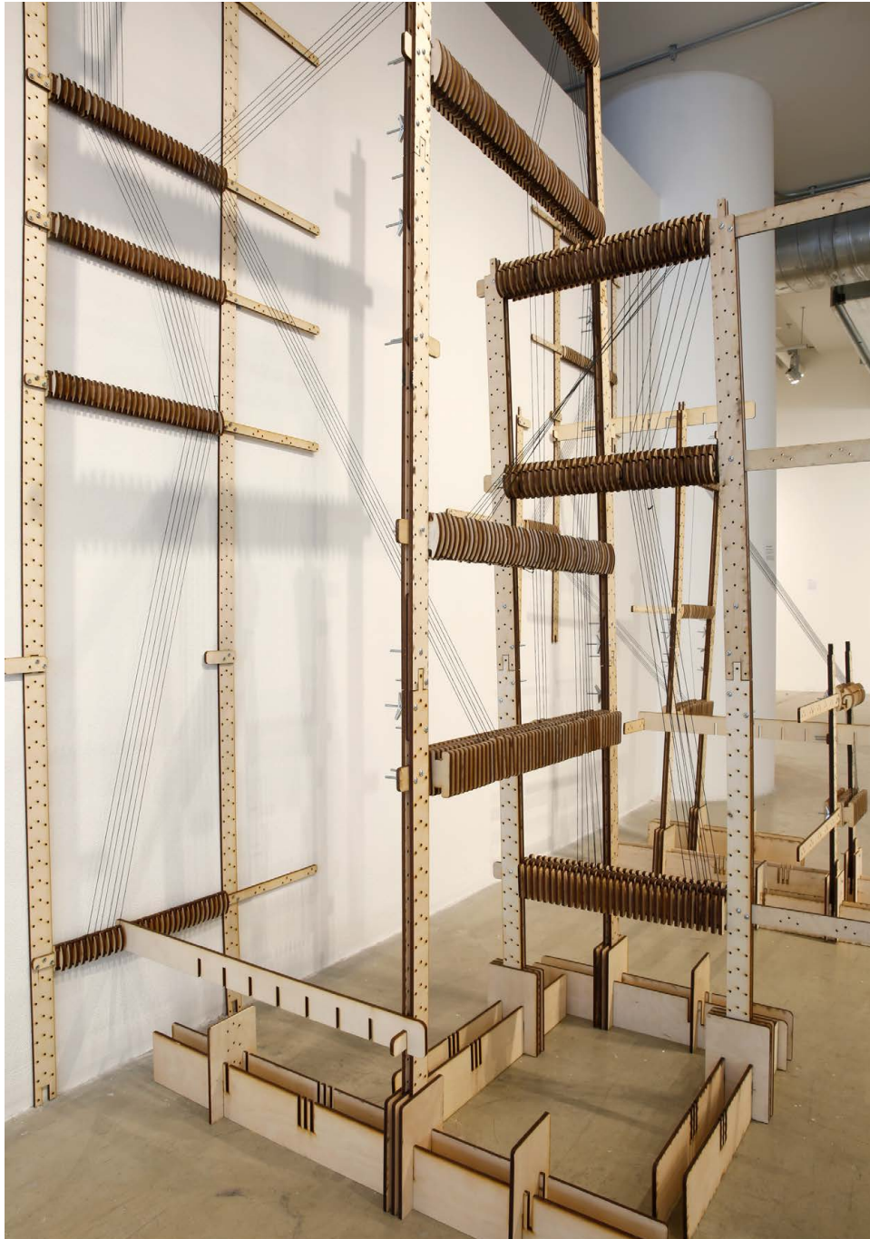
Latrelle Rostant Modular Loom , 2018 Birch plywood Dimensions variable