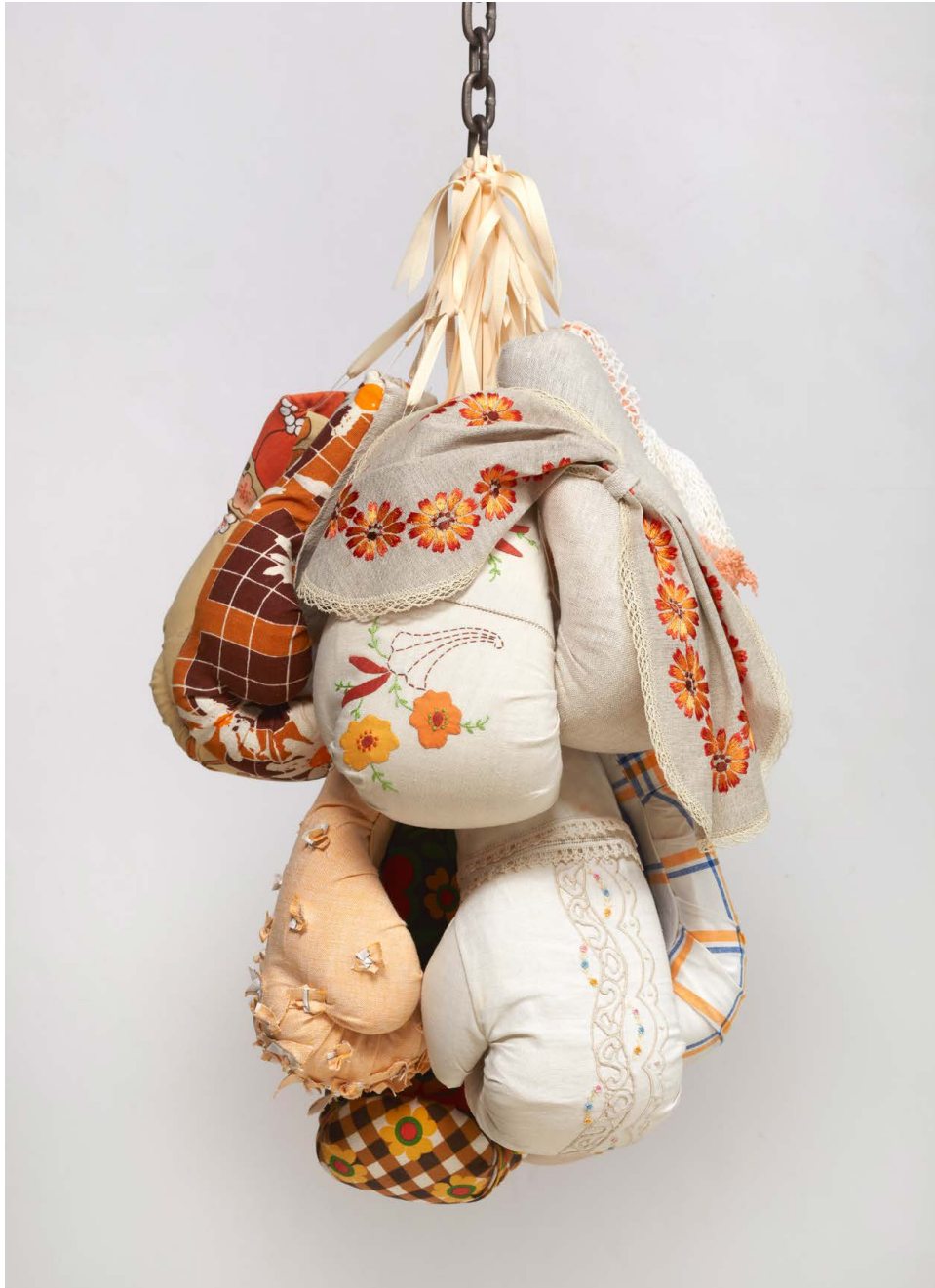
Zoë Buckman According to Grandma , 2019 Boxing gloves, vintage linen, ribbon and chain 29 x 19 x 15 ½ inches