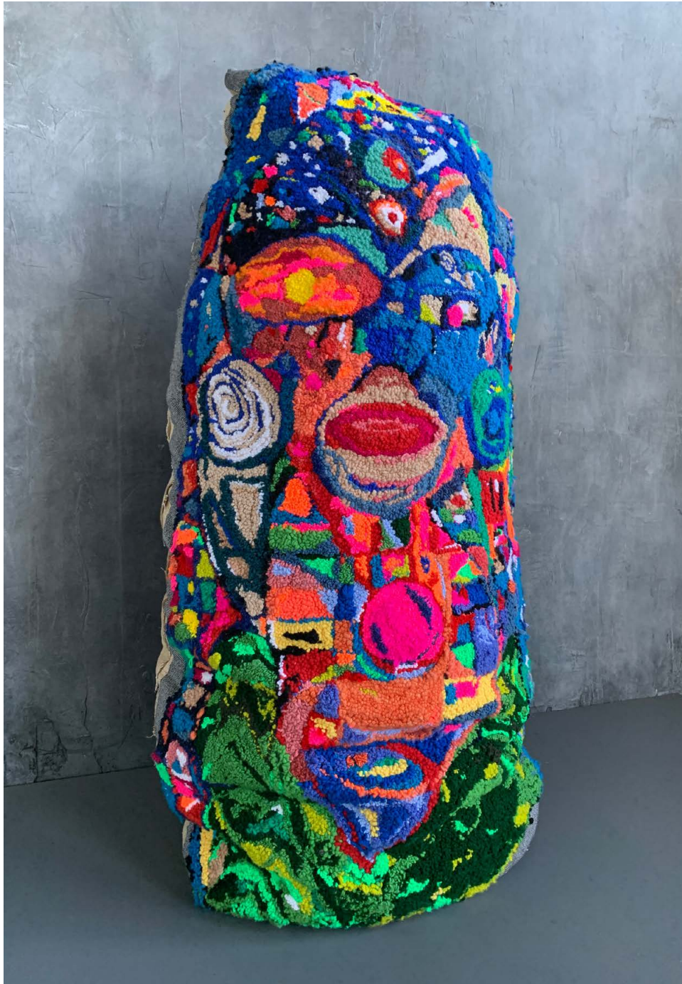
Tamika Rivera An offering to Atabey , 2021 Hand punched soft cotton sculpture (wool, cotton, recycled linen) 52 x 24 x 22 inches