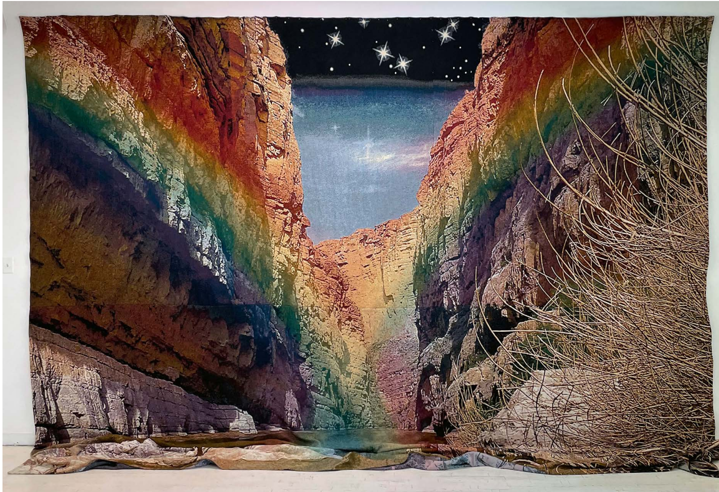
George Bolster The Double Rainbows of Tatoonie (Kepler 16b): Truncated Timelines Inhibit Our Understanding of Who, Where, and Why We Are, 2021 Jacquard tapestry 156 x 192 inches