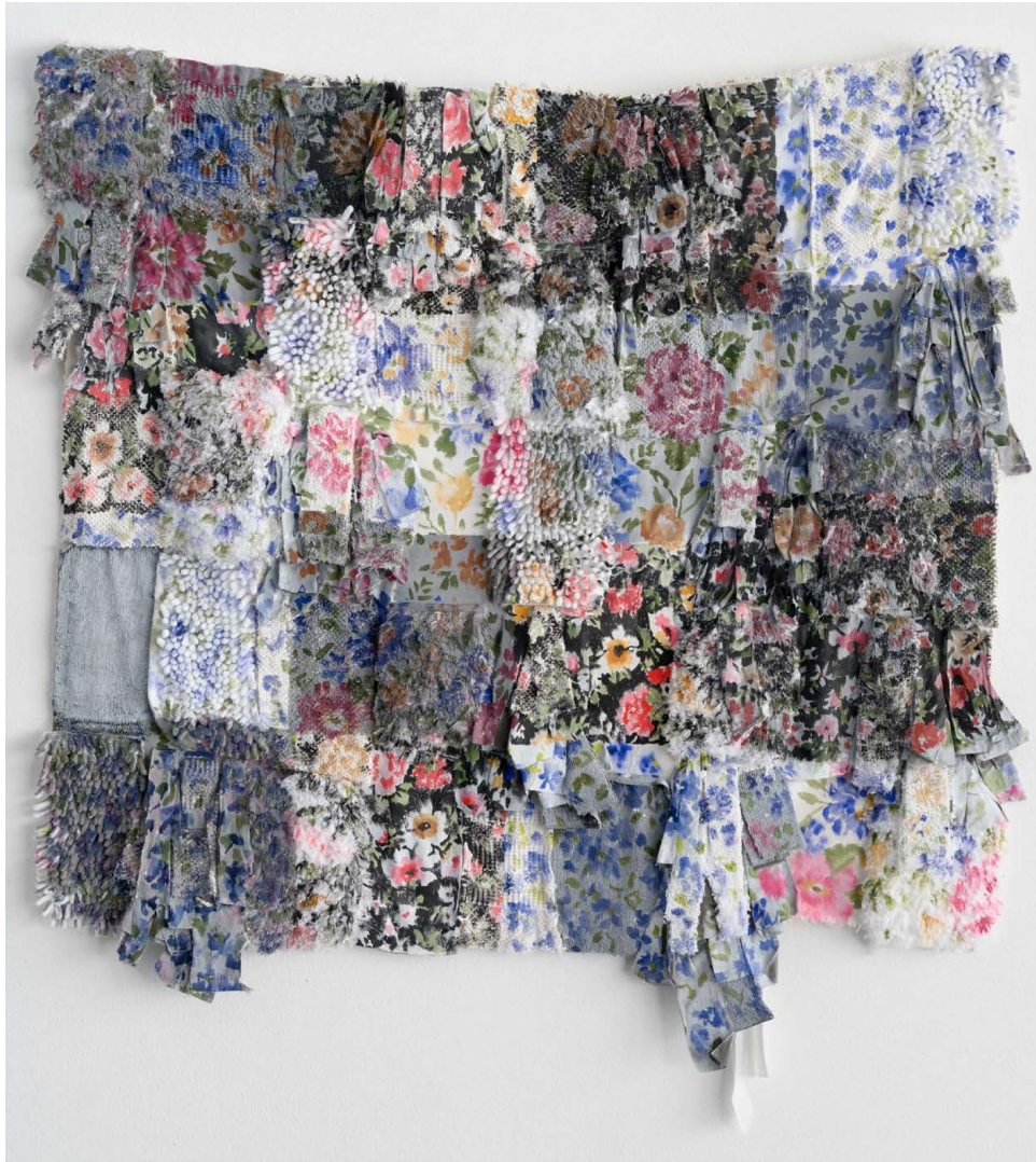
Manuela Gonzalez Untitled, 2021 Acrylic on mixed fabrics 36 x 40 inches